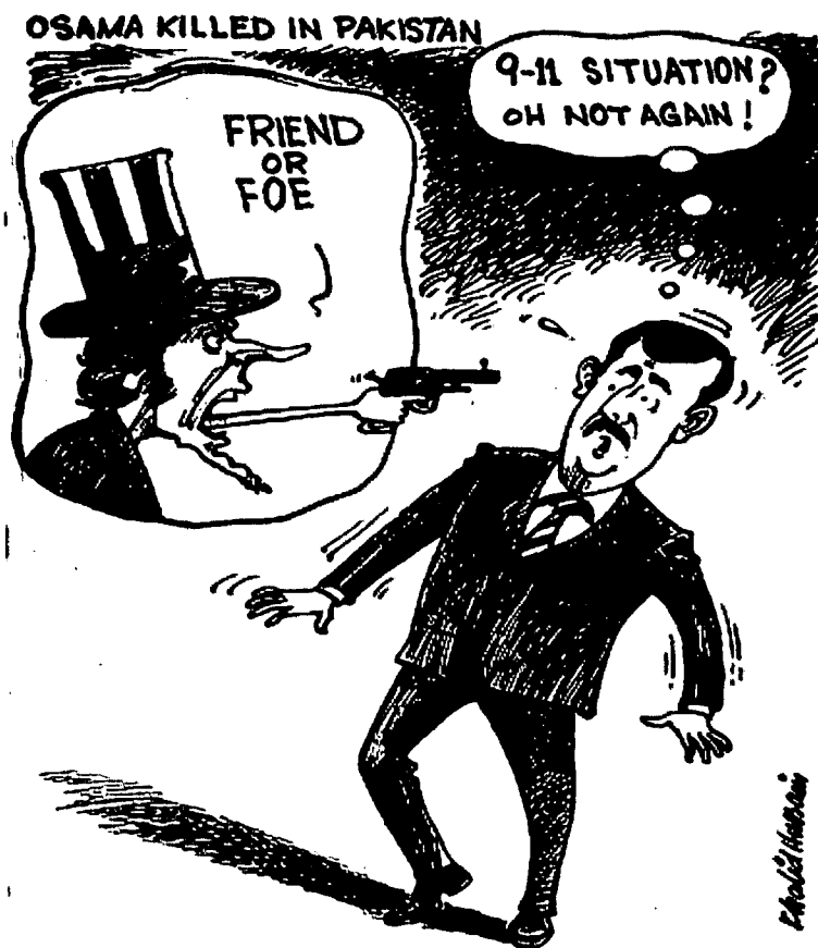
"Pakistan Observer" (05/04)