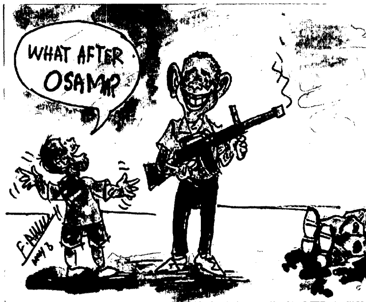
"Daily Times" (05/04)