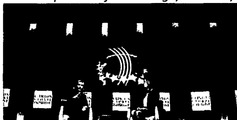
U.S. Secretary of State Hillary Clinton speaks during closing plenary of Clinton Global Initiative

Envisioning a world in which personal mobile technology can connect every human being in every village in every country to the tap roots of knowledge, markets, services, and community